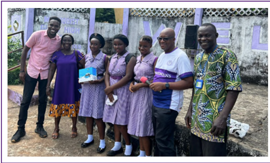
Awarding prizes at the Methodist Girls High School