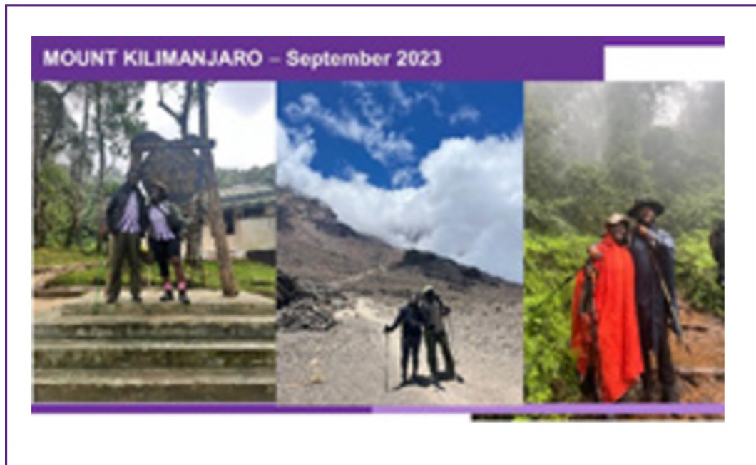
Mount Kilimanjaro for STEM: A Triumph of Determination