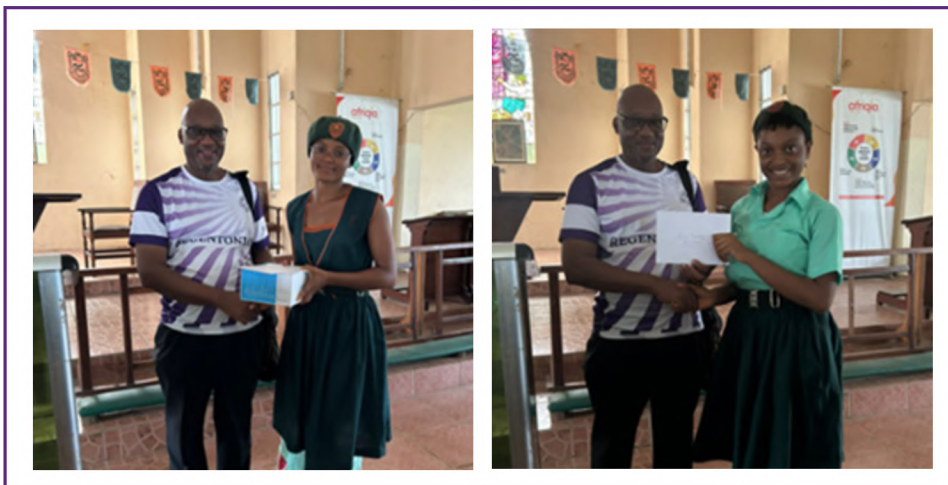
Presenting prizes to the pupils of Annie Walsh Memorial School, sister school to SLGS