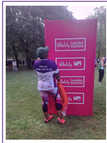
Image from the Team Regentonians at Vitality London 10k

Aside from the Ride London event, we also participated in the Vitality London 10k run, which followed a scenic route ending at Buckingham Palace. Building on this year's success in running and cycling fundraising, we secured places in additional marathon events, for next financial year, such as Paris 2024, Brighton 2024, and the London Big Half 2024. These activities will establish a new revenue stream for our organisation and enable us to engage alumni and friends interested in sports.